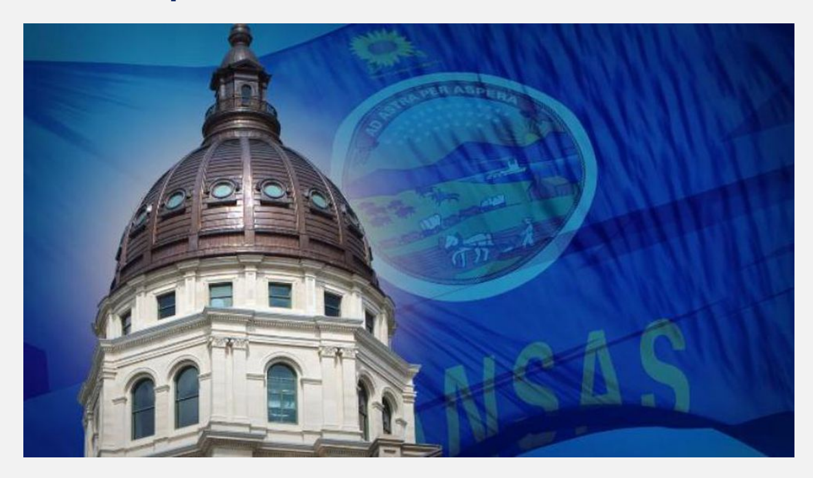
SPARK Executive Committee to Hold Regional Meeting in Dodge City

The SPARK Taskforce Executive Committee will hold a regional meeting in Dodge City at 3 p.m. Thursday, November 4, 2021, to gather information and feedback from Kansans.